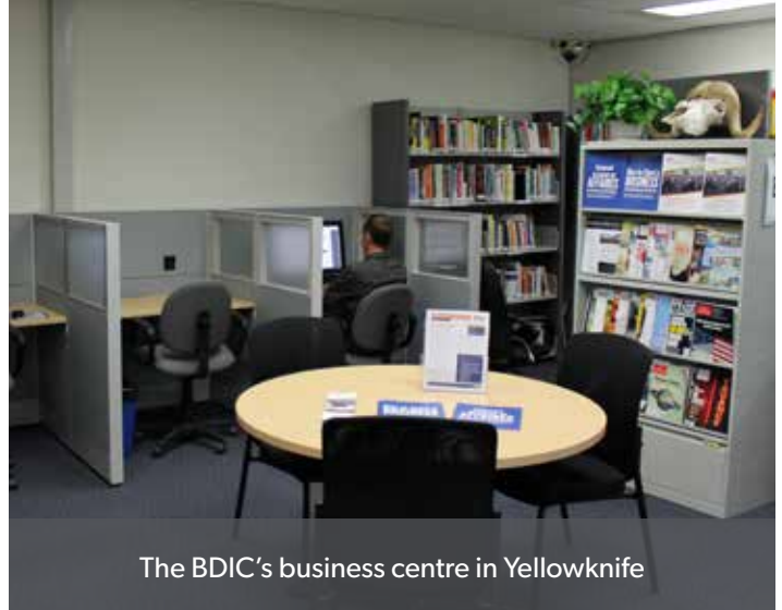
The BDIC's business centre in Yellowknife

How to Start a Business in the NWT is available in print, on the BDIC's website and via a mobile web app. The guide is available in both English and French.