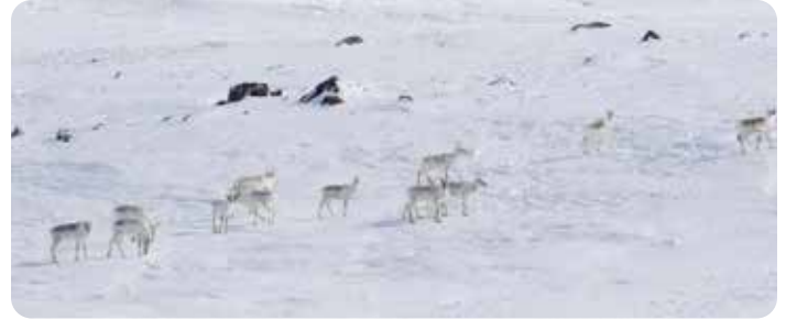
Dolphin and Union caribou

The Species at Risk (NWT) Act provides a process to identify, protect and recover species at risk in the Northwest Territories (NWT). The Act applies to any wild animal, plant, or other species that is managed by the Government of the Northwest Territories. It applies in most areas of the NWT, on both public and private lands, including private lands owned under a land claim agreement.