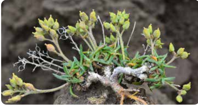
Hairy braya

Under subsection 16(1) of the Species at Risk (NWT) Act , the Conference of Management Authorities (the Conference) must submit an annual report to the Minister of Environment and Climate Change by September 30 each year. This annual report covers the fiscal year ending March 31, 2025.