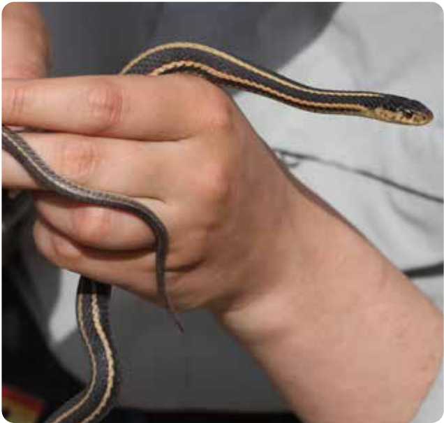
Researchers conducting fieldwork with red-sided garter snakes in 2024 – Photo credit: Peter Lin